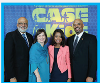
Hip-Hop Dance Group and Author are Attractions at CASE for Kids Conference p. 3