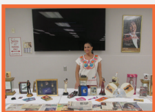
Academic and Behavior School-West Location Celebrates Hispanic Heritage Month p. 4

As we enter the month of October, we closed out the month of September running at full speed. We began this week on the heels of a successful CASE for Kids Out-of-School Conference which concluded last Saturday. The two-day conference gathered leading out-of-school time and expanded learning professionals in one location for a two-day journey that sparked deep conversations surrounding meeting the needs of students once the school day is over. It was an excellent event that was well-attended and showcased the strong partnerships we have with service providers who offer quality out-of-school programming.