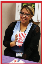
Popcorn Social Hosted by Human Resources p. 3